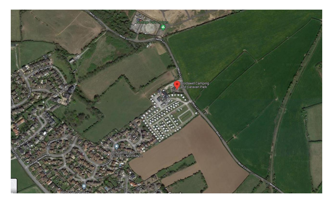
Fig. 1 – Aerial Photograph of the Application Site and Surroundings

The application seeks full planning permission for the change of 25 Touring Caravans to 25 Static Caravans, associated infrastructure, ecological and landscaping enhancements and the retention of 68 Touring pitches at Brodawel Camping Park, Moor Lane, Porthcawl.