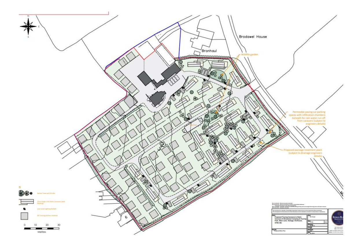
Fig. 2 – Proposed Site Layout

The proposed static caravans will measure approximately 11m x 4m and to an overall height of 3.8m with a pitched roof. Each static caravan will comprise of three bedrooms, kitchen/dining area and w/c with shower. The wheels will be supported by concrete block piers and axle stands and will be covered by a continous timber skirting. There will be a decked area erected around part of the caravan which will measure approximately 7.7m x 4.5m and to height of 1.5m with a wooden balustrade.